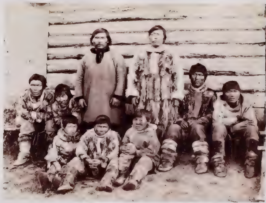
Group of Eskimo Men & Boys